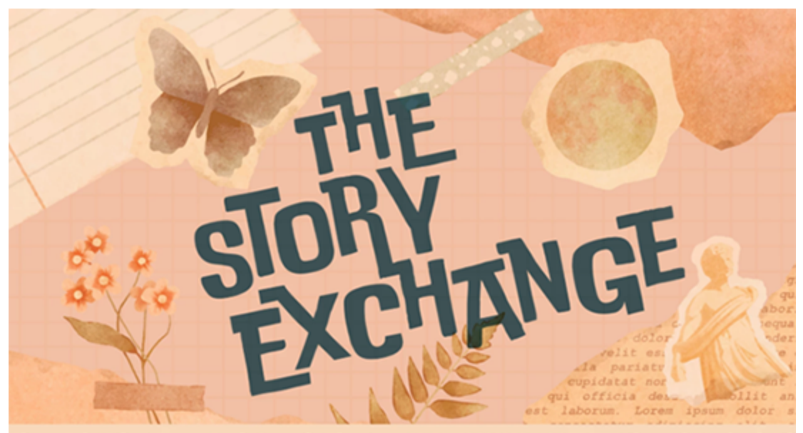
Thurs Feb 13th at 7pm # Push Comedy Theater # SUBMISSIONS ACCEPTED through Wed Feb 5th

Tonight at 7pm! Get ready for a Lunar New Year celebration like no other at the Chrysler Museum of Art. It's the year of the snake, so expect intrigue, mystery, and a little cattiness flung in for fun. Inspired by the Museum's Asian Art galleries, this IgNITE is all about joy, transformation, and having a blast. For good luck and prosperity, dance the night away, laugh with comedians, and be wowed by a Chinese Lion Dance, tarot card readings, and fun surprises. Members and non-members can join in the fun by purchasing a ticket here .